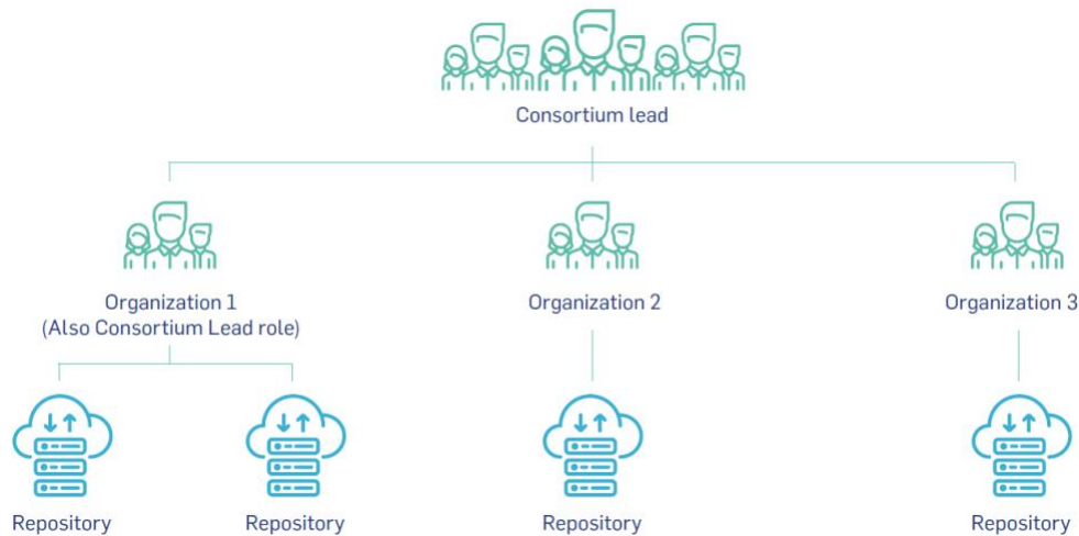
EXAMPLE PRICING: THREE CONSORTIUM ORGANIZATIONS AND A VARIED NUMBER OF REPOSITORIES AND DOIS

A consortium is a group of like-minded organizations that have come together to collectively participate in DataCite’s community and governance activities and use DataCite’s DOI services. A consortium is composed of two or more non-profit organizations that are under different administrative structures. Each consortium pays a single annual membership fee totaling 2000 euros – the membership fee is often split between organizations within the consortium. Each organization within the consortium pays DOI service fees. DOI Services Fees are based on the number of repositories and DOIs within a single administrative unit within an organization. One organization within the consortium is designated the consortium lead and fulfills a range of responsibilities.